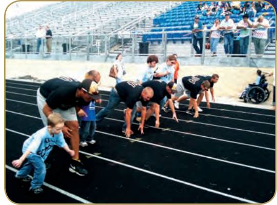
WC Coyotes baseball players enjoyed a day with children at the annual Special Olympics. "On your mark, get set, go!" (The Coyotes lost...)

of kids – good stuff. And, although my guys did not win one race, we had a great time - something our guys will remember for a long time.