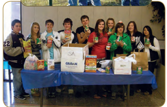
Photos from top down: Working together, cadets in WC’s Public Safety programs, helped update the local 4-H arena - including painting the fences. Upward Bound students collected canned goods for an area food pantry.