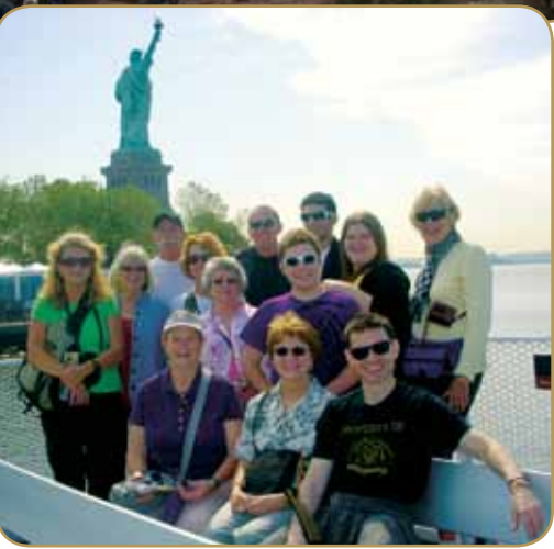
Photos from top down: Students from the 2009 England, Ireland and Wales trip. Students from the 2009 Big Bend trip. Participants of the 2010 New York Trip.